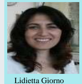
Istituto per la Tecnologia delle Membrane CNR- IM, Italy.